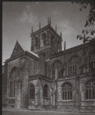
For the Sunday after Ascension Day (Exaudi)

In performing these cantatas we had to contend with the variable acoustic of Dresden's unalluring Annenkirche – boomy yet shrill when empty, far drier when full – and with the uncomfortable sensation that the sounds we produced were dropping two paces in front of us. Clearly this was not a problem for the Dresden audience, whose response at the end of the concert was warm and generous. I got the impression that all of us were intensely moved to have been granted this opportunity to celebrate Bach's music in the city of his dreams.